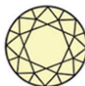
N-R Very light